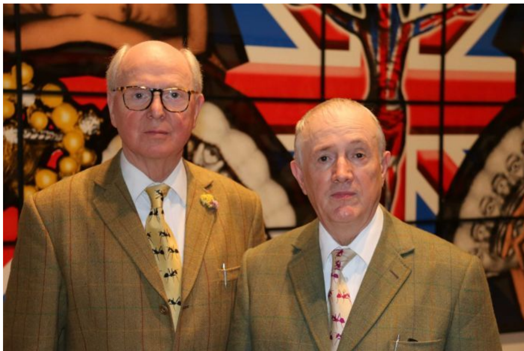
PHOTO: British art duo Gilbert and George say a visit to MONA persuaded them to exhibit there.

They are two people but one artist. Gilbert and George, like Madonna, have no need for surnames - the couple are rock stars of the modern art world.