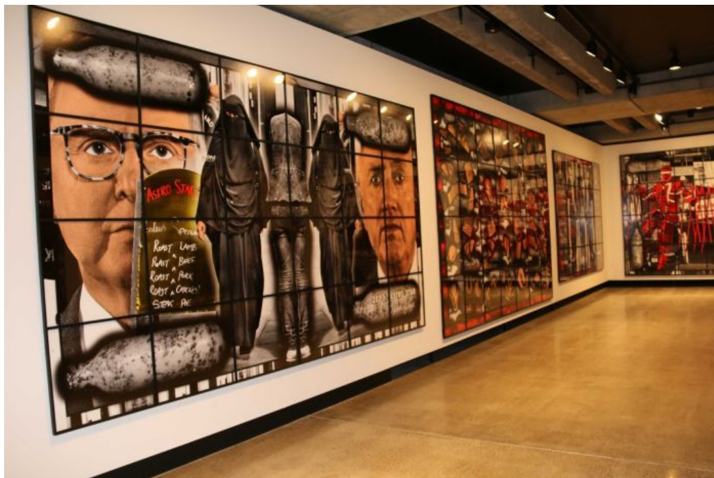
PHOTO: British art duo Gilbert and George's MONA Exhibition will be open until March 2016. (ABC News: Fiona Blackwood)

The exhibition is mostly retrospective, with works dating back to the 1970s. The pictures have controversial takes on universal themes like death, hope, fear, sex, money and religion.