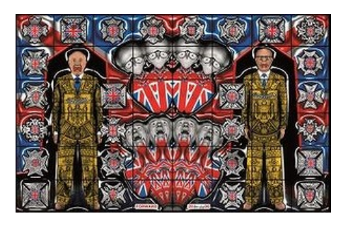
FORWARD, 2008 Gilbert & George Mixed media.