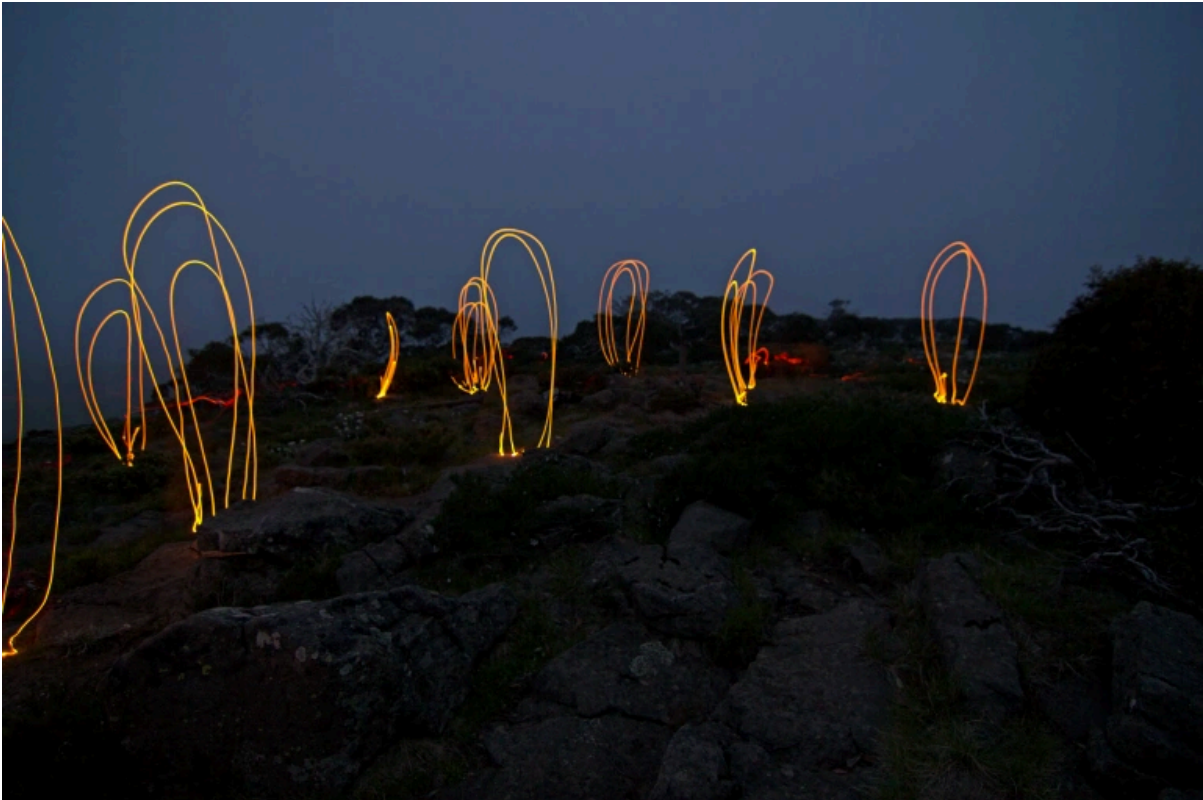
Loops Mt Jim Magnetic Anomaly, Loops II 2011 Cameron Robbins

Field Lines will include an imposing collection of 16 drawings, up to five metres in length from Wind Section Instrumental (2013), plus installations, photography, sculpture and video, as well as works being created on-site throughout the duration of the exhibition, involving tidal motions from six metres below the museum and the forces of wind from above.