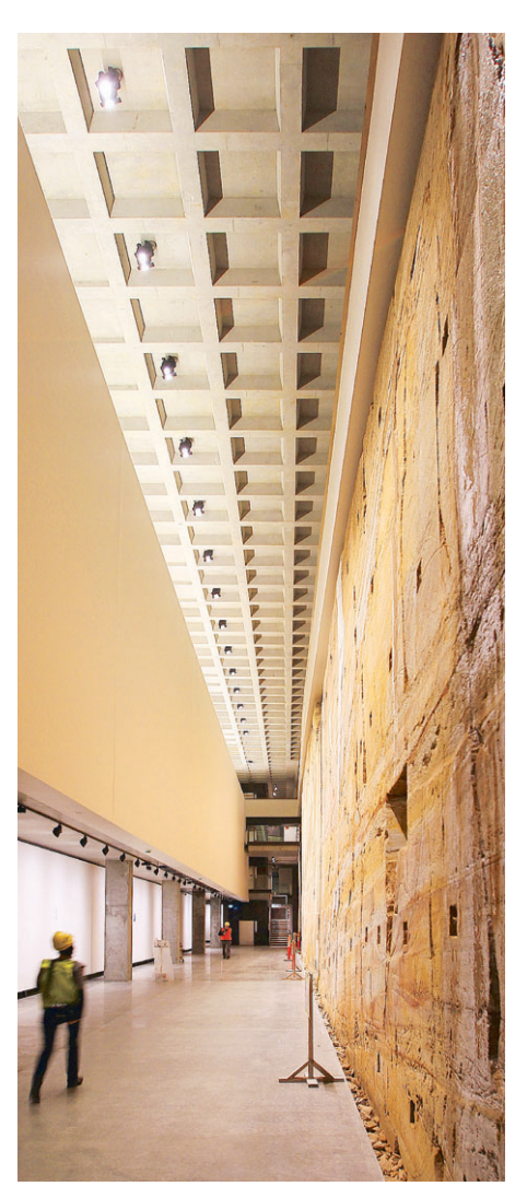
STUNNING: Part of the exposed sandstone wall in the art gallery and museum.

And while she admits she doesn't get to spend as much time on her own art these days, her hands-on appreciation for art is invaluable for her job at MONA.