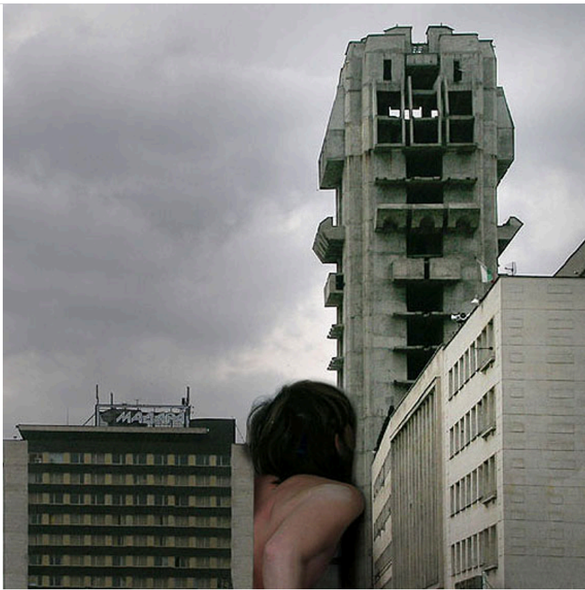
Eva Davidova Untitled (Shumen) 2005 lambda print, 49 x 49 in. (124.46 x 124.46 cm)