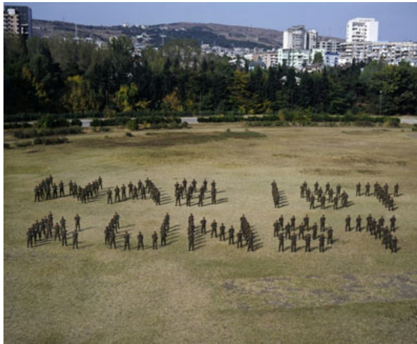
IRWIN Was ist Kunst, Tbilisi 2007 © IRWIN