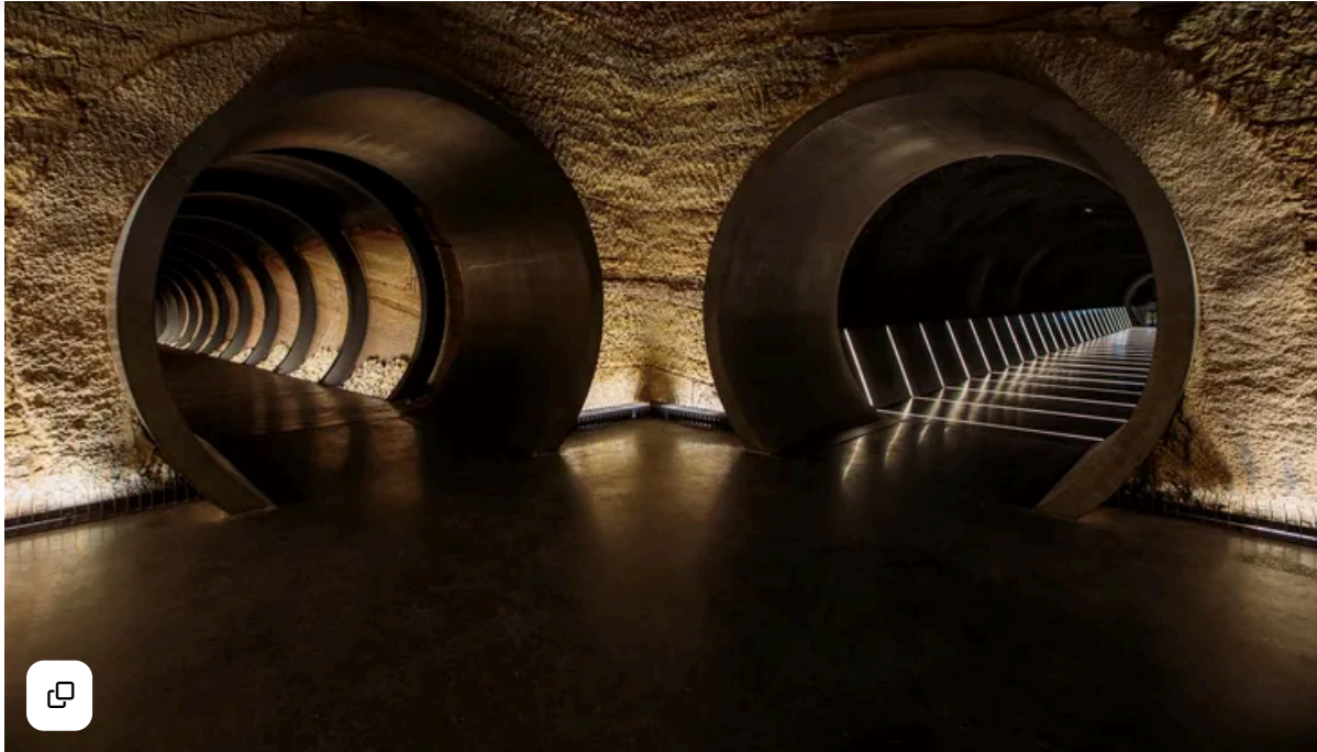
Siloam expansion at Mona by Nonda Katsalidis and Falk Peuser of Fender Katsalidis.

The project is the latest in a string of MONA-related projects for Fender Katsalidis, beginning with the museum itself, the Pharos extension and a proposed hotel and casino . The practice also recently unveiled designs for the first stage of the redevelopment of a part of central Hobart that includes the historic Odeon Theatre as a new “ cultural precinct ” for Darklab, a MONA subsidiary.