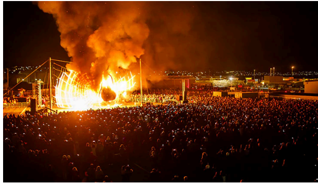
The Burning Ogoh-Ogoh

Information included in this blog is correct at the time of publishing. Please contact individual operators for further information.