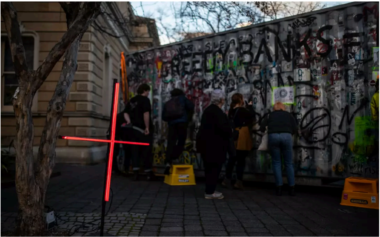
📷 ADP Container, Hobart Town Hall.

Peer inside to see different perspectives of a miniature wonderland.