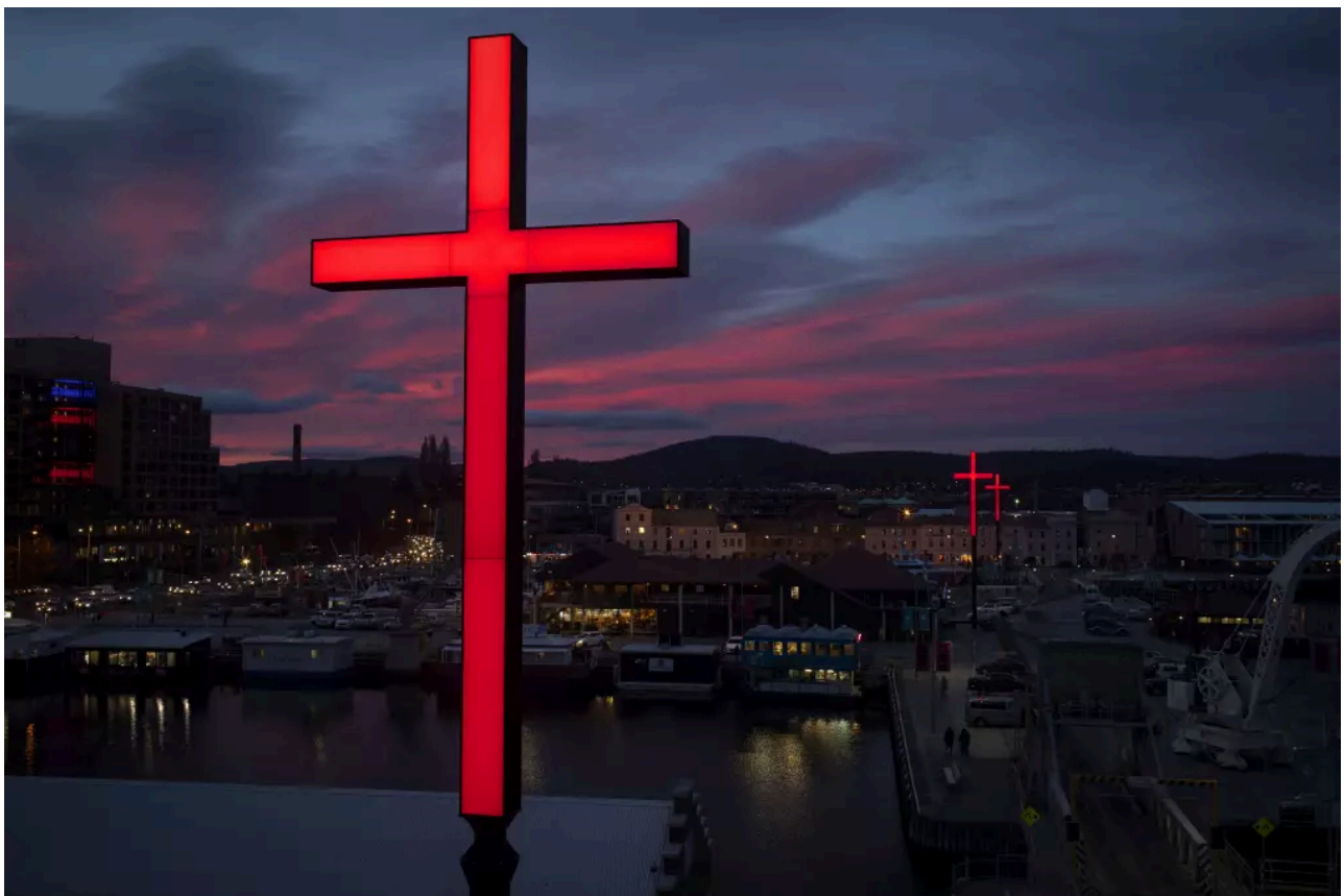
Dark Mofo's waterfront crosses.

As Dark Mofo ramps up for its third and final week, here's our guide for what not to miss across the festival.