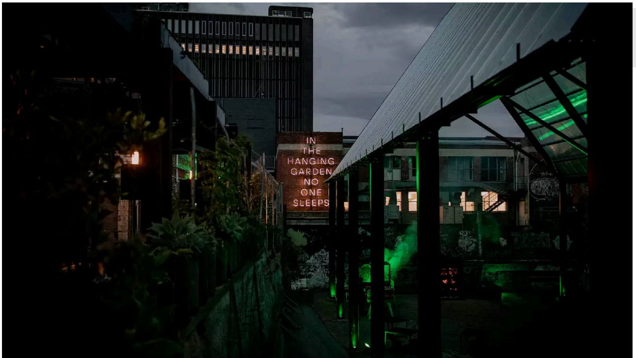
📍 In the Hanging Garden.

The precinct will remain open permanently after its launch at the start of the festival with a nightclub, High Altar, scheduled to open on the second floor in September.