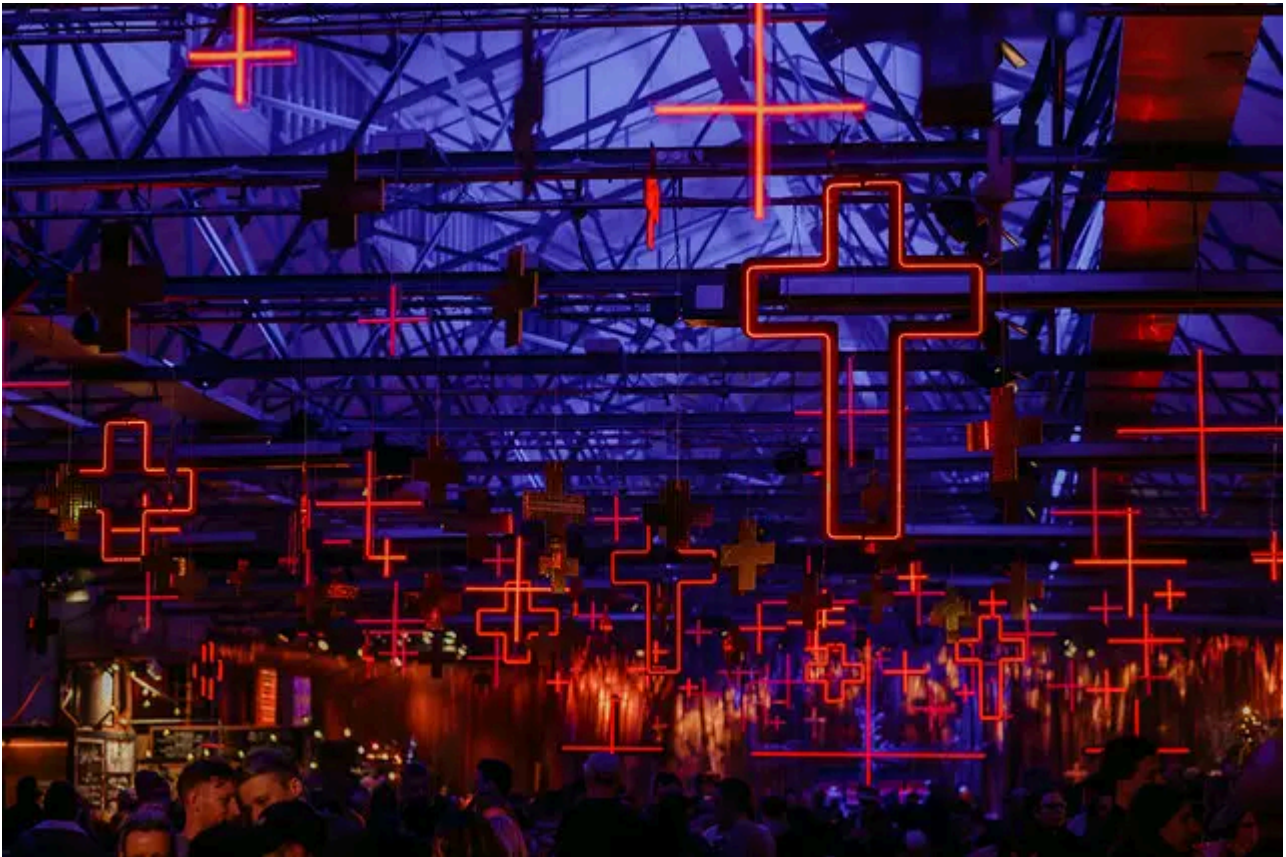
📷 Dark Mofo + City of Hobart Winter Feast.

A night out during Dark Mofo would not be complete without a stop at the Winter Feast.