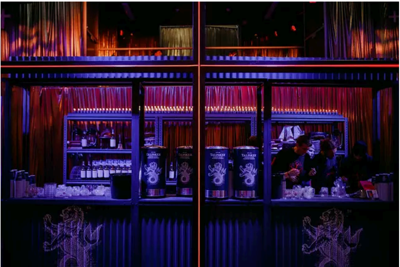
📷 The Talisker Whisky Bar on Dark Path.