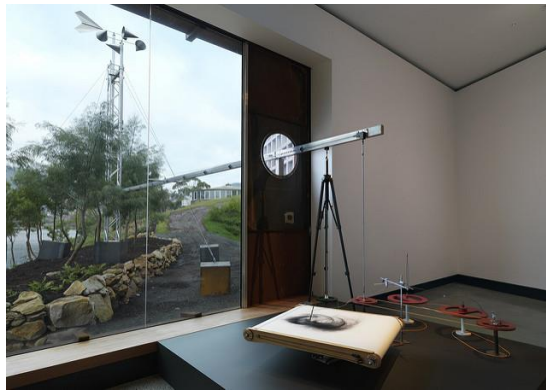
Wind Section Instrumental (2013)

Exhibition dates: 18 May to 29 August 2016 Official opening: 4pm Saturday 11 June 2016